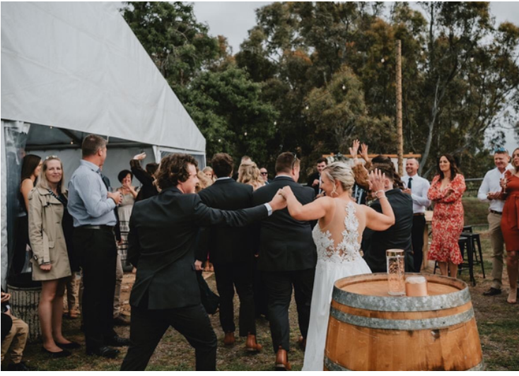
As a dry hire venue, we offer a unique twist that sets us

When you choose us, you gain more than just a DIY space. Kristen, our dedicated wedding coordinator, and our exceptional team go above and beyond to ensure your day is perfect in every way. We take care of all the logistical details, including coordinating marquee or Tipi hire and arranging additional furniture beyond our standard package.